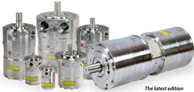
The latest edition to the Danfoss range of APP pumps